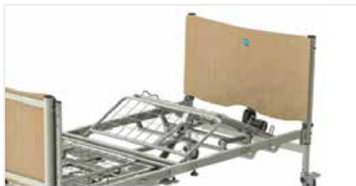
Leg section angle adjustment