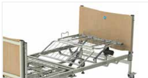
Leg section height adjustment