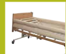
Hebden side rail mesh pads