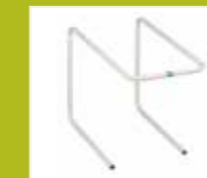
Cantilever bed cradle