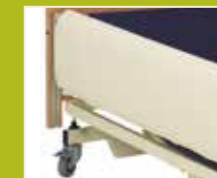
Hebden side rail pads